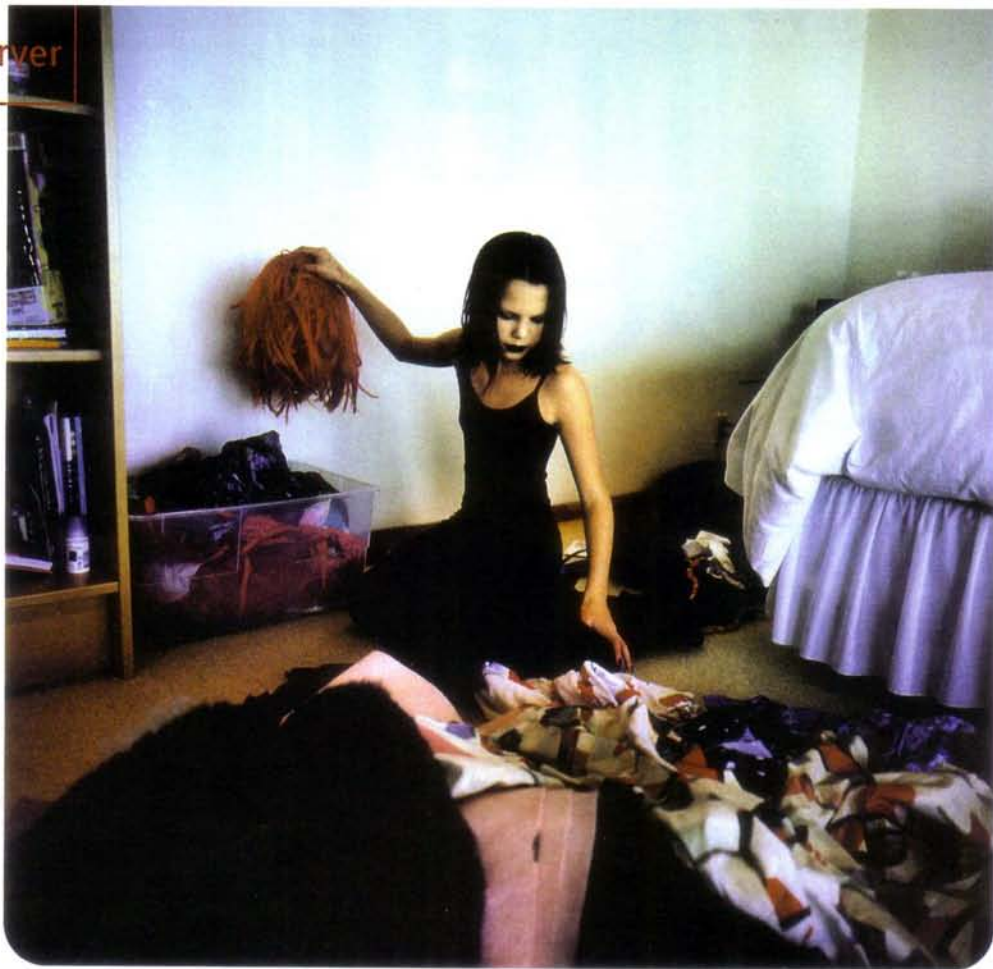
Between Roles Clancy deconstructs her image, seated with a dancery grace that is more seductive than the in-your-face put-ons of her icon-interpretations. "This is a process shot," says London. "She still has some makeup on and those are all the clothes spread everywhere. It's very unkempt, and I like the energy of what is going on." Laura London Rock Star Moment 6 , 2000, color photograph, edition 1/3, 30" x 30"